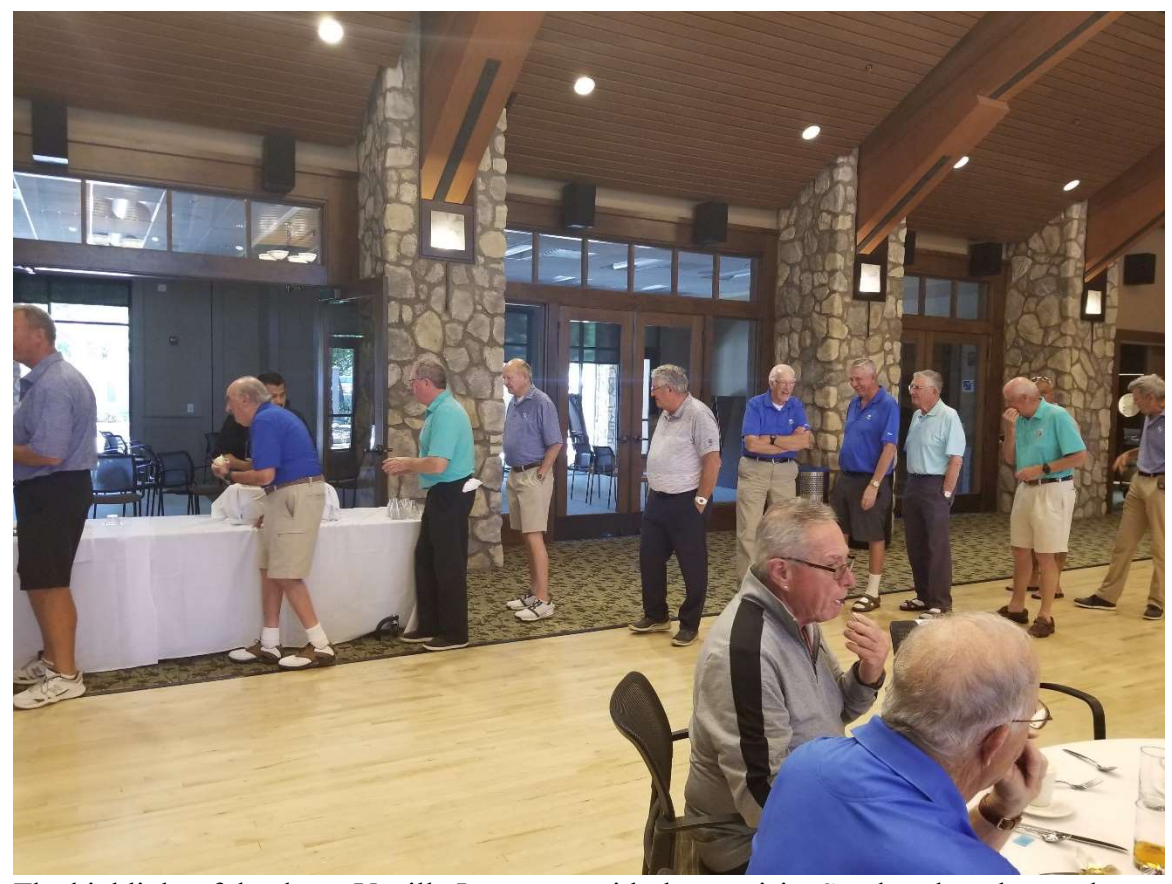
The highlight of the day – Vanilla Ice cream with the requisite Sundae chocolate and butterscotch sauces along with some great toppings.