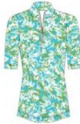
AVERY 1/2 SLEEVE

H14531TM Sleeveless Print Polo with Zip Closure & Mandarin Collar. (Polyester/Spandex)