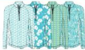
TEMPO LS MOCK

XS-XL Ref: (MST), White (WHITE) 20465022